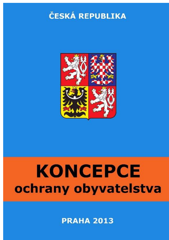
Picture 1: Cover sample of the penultimate Population Protection Concept from 2013

The concepts mentioned above were always a reflection of the time in which they were created, they were consistently and honestly based on the state of scientific knowledge and established professional tasks and measures for the next period. It is not without interest that the concept