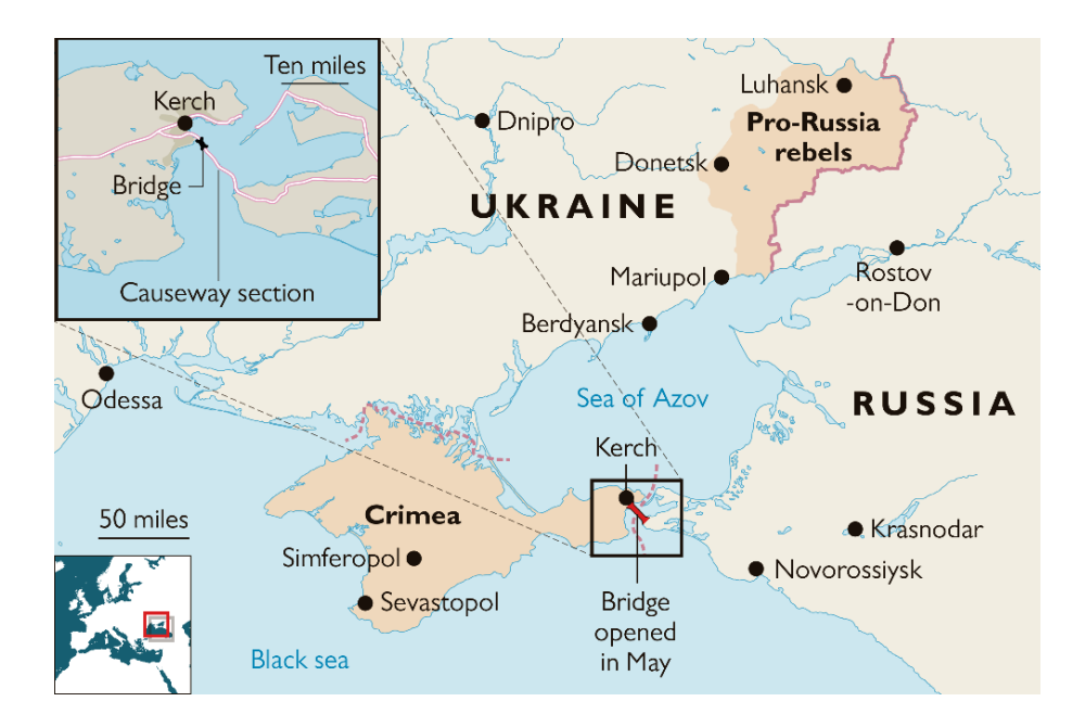
Figure 2: Kerch Strait

The Kerch Strait Incident in November 2018 is the first confrontation between Russia and Ukraine over the waters of the Sea of Azov and over the land border of Ukraine.<sup>9</sup> The clashes in the Kerch Strait could lead to conflict escalation, following the annexation of Crimea by Russia in 2014.<sup>10</sup> The incident happened after a bridge was built between Crimea and the continental territory of Russia. Specifically, on 25 November 2018 three Ukrainian vessels attempted to cross the Kerch Strait from the Black Sea to the Sea of Azov, aiming to reinforce the Ukrainian naval force at Mariupol and Berdyansk.<sup>11</sup> Russian Coast Guard vessels, supported by helicopters and warplanes, fired on the Ukrainian ships injuring six sailors, after which they detained the vessels and their crew.<sup>12</sup> The Crimean courts detained the 23 sailors for two months before a trial, which demonstrated that the Russian forces were openly engaging with forces from Ukraine, while the previous presence of Russian troops in Crimea and military involvement in Ukraine had not clearly shown open aggression.<sup>13</sup>