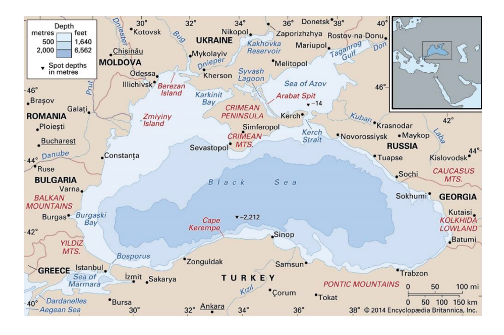
Figure 1: Black Sea

The main regional competitors around the Black Sea are Russia, Türkiye and the West, combining NATO and the EU. The Black Sea is of geopolitical and geostrategic importance for Russia and Türkiye. It provides access to territories for military action, energy security projects, trade, therefore increasing their regional influence. For Russia, it provides access through the Kerch Strait, the Bosphorus and the Dardanelles to the Mediterranean Sea. For Türkiye, it provides access through the Kerch Strait to the Sea of Azov and the inner territory of Russia via the Don River. Also, the Black Sea provides access to the inner territory of Ukraine and Belarus through the Dnieper River. It is a major trade corridor generating wealth, with strategic importance in blocking the enemy in case of a war. The Black Sea is connected to the inner part of the European continent through the Danube River. NATO has access to the Black Sea through the Bosphorus and Dardanelles Straits, controlled by Türkiye, and the Danube River's delta controlled by Romania, but sharing 630km of river border with Bulgaria. Romania and Bulgaria are both EU and NATO members. Türkiye is a NATO member, but with regional interests in the Black Sea, historically competing for influence with Russia. Therefore, the behaviour of Türkiye in NATO is not completely predictable.