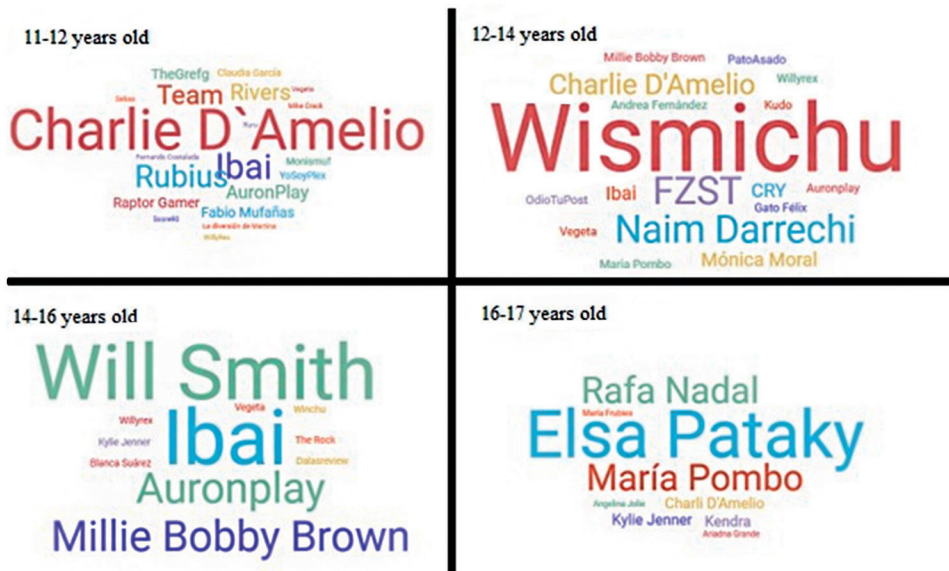
Figure 1: Influencers followed by adolescents by age Source: Compiled by the authors.

Younger adolescents were increasingly drawn to profiles that were more focused on social media and became famous through their online activity, such as Charlie D’Amelio, Rubius, Wismichu and AuronPlay. However, participants between 14 and 16 years old tended to follow individuals who were famous for activities beyond social media, such as singers, athletes and actors, including Elsa Pataky, Rafa Nadal, Millie Bobby Brown and Will Smith. This shift in preferences may be related to the fact that adolescents between 11 and 14 expected a more intense and personal relationship with social media influencers.