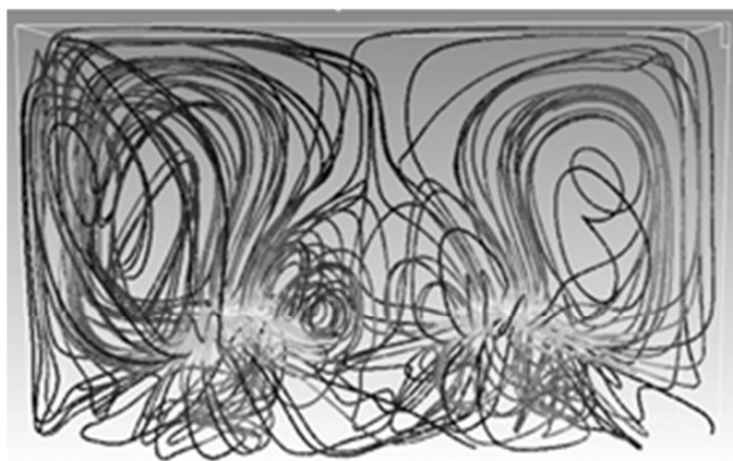
Fig. 2. Streamlines starting from mixer plane (rpm: 100 and 400 \text{min}^{-1} )

As a result of the simulation well-resolved pressure and velocity fields could have been gained. For better representation of the flow, streamlines are drawn from the mixer (see Fig. 2 and Fig. 3 ). Fluid particles basically show vertical flow dominance. As the flow reaches the water surface it reverts and the movement becomes downward closing the circulatory pattern. In the center of this circulation flow the detention time is above the average residence time, stagnant zones could appear. Flow pattern is similar if 100 or 400 \text{min}^{-1} rotational speed is applied. The difference between the two cases is the average velocities in the basin induced by mixing.