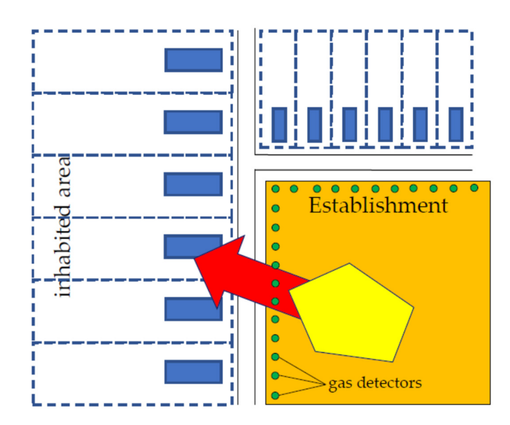
Figure 2. Installation of gas detectors (schematic figure).

Defining the signal and alert levels of the monitoring stations had a high priority. The signal and alarm levels had to be determined for the monitoring stations, for which the introduction of public protection measures was already justified. At the same time there is enough time to filter out any false alarms. According to the rules of procedure in case of a major accident, the results of the measurements are evaluated and then, if necessary, the affected population is alerted and informed via the siren system (alarm stations) [32].