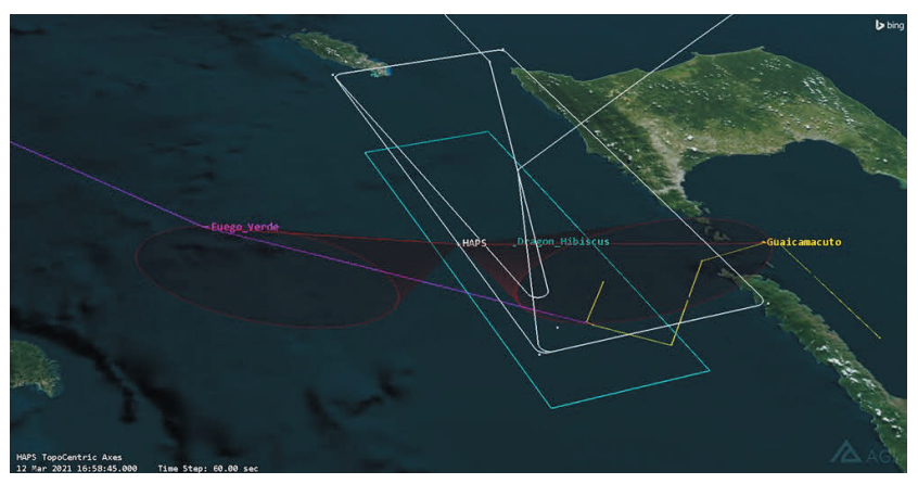
Figure 3: 3-dimensional overview of the operation

A patrol pattern was uploaded to the HAPS from the operations centre via satellite, and the aircraft started the continuous scanning of the surface. When an unidentified speedboat, not broadcasting AIS signals, was detected, the GC-21 was alerted. The patrol vessel moved from its hiding area behind Península de Paria, and steamed out to intercept the boat.