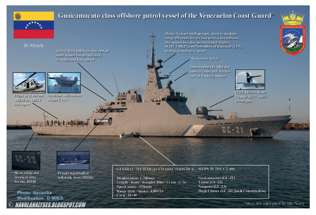
Figure 1: Infographic of the GC-21 Guaicamacuto class offshore patrol vessel<sup>8</sup>

To interdict the terrorists, law enforcement services asked for the assistance of the Bolivarian Navy of Venezuela. The Commandante General of the Bolivarian Navy designated the patrol vessel GC-21 Guaicamacuto for the operation.