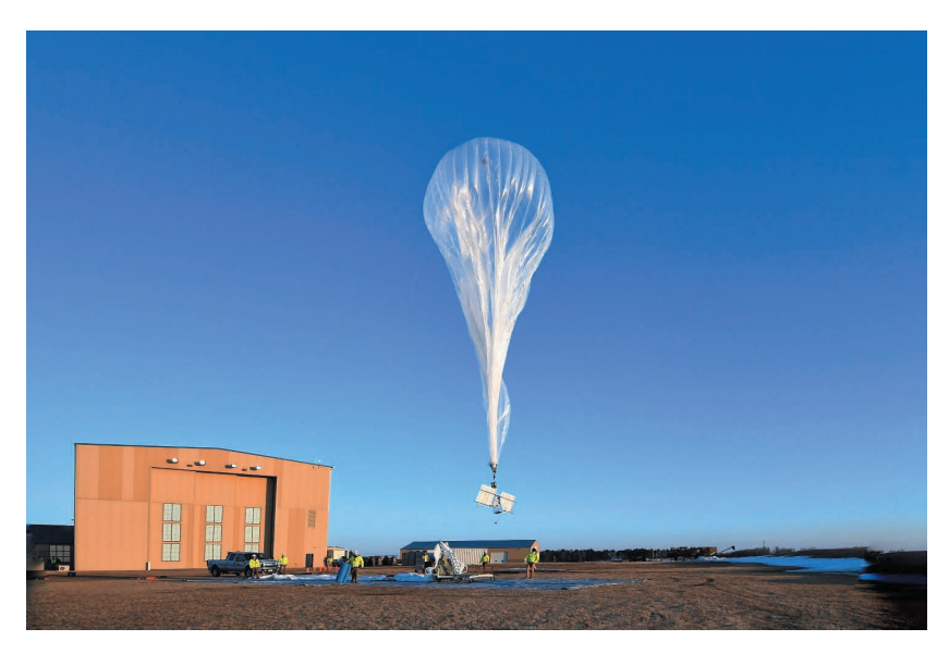
Figure 7: Launch of a Raven Industries Aerostar balloon carrying an experimental payload

Station keeping by a balloon cannot be as exact as by motor-driven aircraft, but it is practically accurate enough for effective operations. However, balloons typically do not land at the end of their mission, unlike airships of fixed-wing airplanes that are recoverable. Balloons usually release the lifting gas at the end of their flight and fall to destruction, however, experiments are ongoing to recover them.