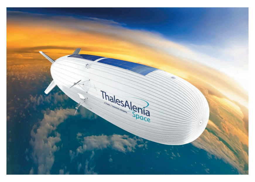
Figure 6: Artist's impression of a Stratobus airship in operation

The second category is the lighter-than-air airship, either soft (blimp) or semi-rigid, that flies with aerostatic lift, but carries electric motors that drive propellers for horizontal plane manoeuvring. Vertical manoeuvring is done by adjusting the buoyancy of the vehicle. Here the solar panels cover the upper part of the airship body. The body is filled with a lifting gas, typically helium, which is a non-renewable resource, expensive and diffuses through the body material even faster than hydrogen, but it is much safer. With these vehicles, the length of a flight is also constrained by the escape rate of the gas.