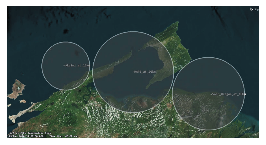
Figure 8: Overhead visualisation of the coverage areas of a HAPS and two HALE RPAS

northeastern Venezuelan coastal area near Trinidad Island. It must be noted that the HALE aircraft are displayed at their respective maximum nominal flight altitude, while the HAPS is set to its practical minimum.