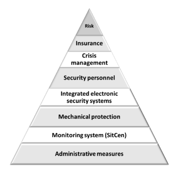
Figure 3. Integrated security systems of multinational companies

The deployment of new security trends in establishing the defence capability of large companies, such as integrated organisational, architectural, security, tactical and management methods, must all be taken into account in order to reduce vulnerability. The employment of all elements of the "security pyramid" can guarantee the achievement of the highest level of defence.