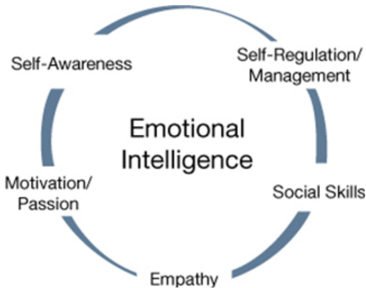
Figure 1. Joint competencies of the leader with vision. [5] [3: 782]

We can see that the issue of leadership effectiveness and responsible behaviour is much more complex and goes beyond whether a person is professionally competent to fill the position. Considering not only the present behaviour and roles, but also the importance of the new leadership competencies of a leader, we can say that leaders being responsible for the organization have to be “leaders with vision”. [3: 782] To meet this expectation such leadership attitude is needed that we can characterize with five basic joint competencies, based on the Goleman-model. [5] (Figure 1)