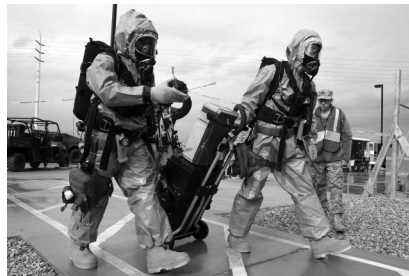
Figure 1. Sampling Group [1]

The sampling unit is a group equipped with special sampling devices and other additional components (see on Figure 1.). It moves via motor vehicles, possibly by aircraft (helicopter). Its members carry out various sub-tasks during the sampling which are an important influence factor in the planning of the establishment of the communication system. Beyond the sampling they perform the appropriate (temporary and safe) storage of samples and the reliable delivery of them to the deployable laboratory.