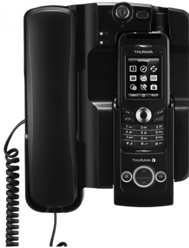
Figure 5. Thuraya FDU and XT-Dual [8]

The above described device is excellent for serving the sampling group's communication needs. Although there are many devices to choose from, in our opinion the devices made by Thuraya, in the present case, have several positive characteristics. [9]