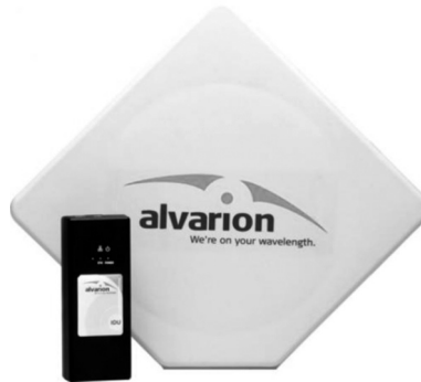
Figure 8. IDU and ODU units of alvarion Ethernet antenna [11]

Thanks to the advanced multipath contact of the ODFM, the system does not need a direct line of sight between the antennas. The system supports other adaptive modulation methods such as the BPSK 14 the QSK, or the quadrature amplitude modulation (16, 64 QAM).