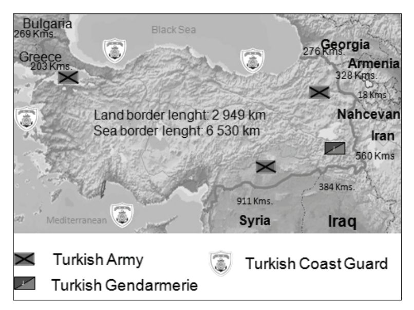
Figure 1. Turkish Borders and Responsible Organizations in Border Protection

Act No. 2692 defines the main tasks for the Coast Guard. It is the competent law enforcement body on the sea, they are responsible for guarding and protecting Turkey's seas (waters), for the protection of life and property at sea, also in territorial waters their task includes the disarmament of refugees and delivering them to the competent authorities; on the high seas they are entitled to prevent all kinds of smuggling, checking ships and boats, to perform search and rescue activities and also to fulfil certain environmental protection functions.