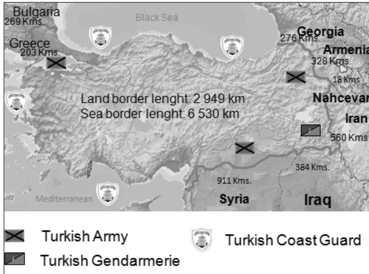
Figure 1. Turkish Borders and Responsible Organizations in Border Protection

Act No. 2692 defines the main tasks for the Coast Guard. It is the competent law enforcement body on the sea, they are responsible for guarding and protecting Turkey's seas (waters), for the protection of life and property at sea, also in territorial waters their task includes the disarmament of refugees and delivering them to the competent authorities; on the high seas they are entitled to prevent all kinds of smuggling, checking ships and boats, to perform search and rescue activities and also to fulfil certain environmental protection functions.