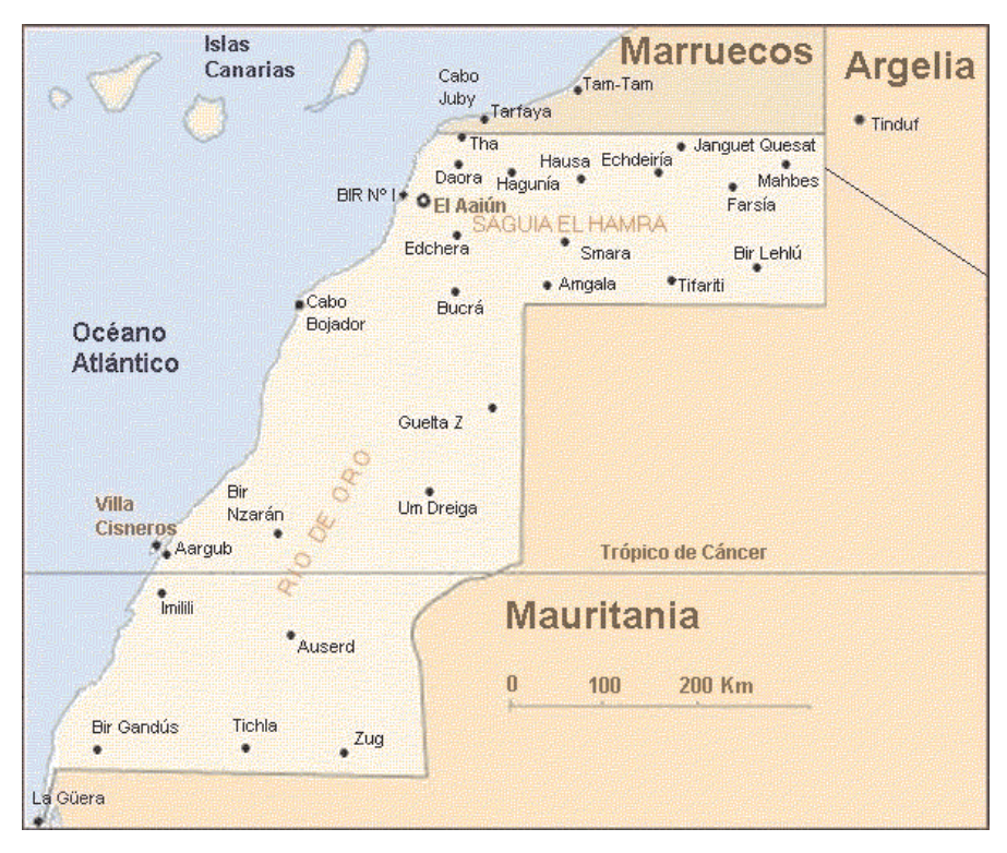
Figure 2. Locations of former Spanish garrisons and military checkpoints

The Spanish Legion was established by King of Spain Alfonse XII in 1920 similarly to the French Foreign Legion. Lieutenant Colonel Millan Astray was appointed the first commander of the Legion, who began to set up the first battalion (bandera) in Ceuta that very year. The soldiers of the unit participated in every local battle until 1976, which saw the withdrawal of the Spanish forces. The personnel of the unit also included soldiers from Sahrawi tribes although their proportion was a few percent only.<sup>52</sup>