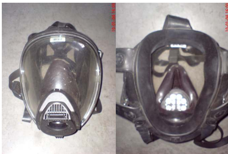
Picture 12 and 13: mask for breathing from front and inside.

The very mask can be hard to separate from the very whole respirator because it forms a unit with the bracer, compressed air bottle, decompressor and other accessories (for example: „bodyguard” system). The mask provides the smooth floating of air which is pressurized and was taken by the fireman to the mask, so it provides the right pressure for the protected parts of face and eyes independently of the environment outside. In the case of mask providing eyesight without distortion, ability to close and to suit properly, convenient vapor-proof property, possibility to communicate, easy and safe fixing are obligatory important.