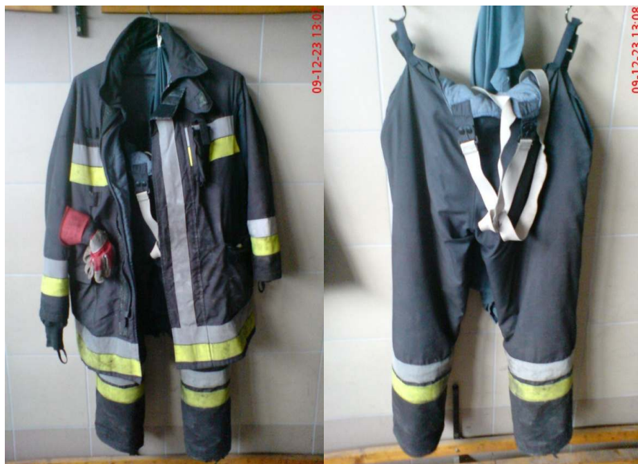
Picture 1 and 2: Sortie fireman coveralls next to the fire engines in store to get the firemen to get dressed as soon as possible. (Own pictures, 2009.)