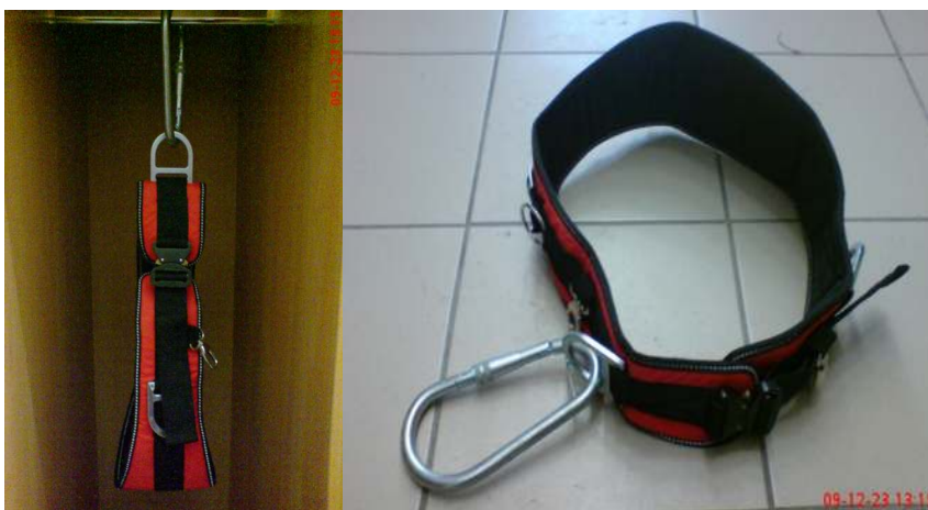
Picture 10 and 11: belt for climbing for firemen, with screw carabiner-swivel against unexpected unbrace, Own photos 2009.

It protects the high working firemen against falling down by tie but various equipments can be fixed onto it. They can be used very well going into places full of smoke in depth or in closed rooms but it has a huge role when firemen save people from high or save themselves. Big carrying capacity and easy tractability is very important. Similarly to everyday belts this belt can also be bought in several sizes according to the peretension of the firemen. Suggested period of time to wear: 5 years.