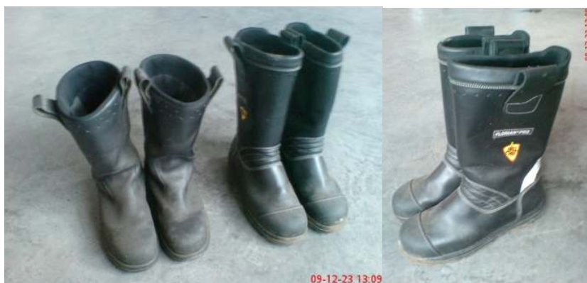
Pictures 7 and 8: Boots made by various manufacturers. (Own photo, 2009.)

Comfort of wearing, providing natural ventilation, possibility of quick dressing up, taking down, protection against sting and cut, non-skidding and protection against several chemicals have to be among the first viewpoints of conformance. Suggested period of time to wear: 5 years