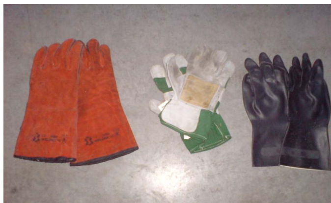
Picture 9: Flame resistant, labour and chemical safety gauntlet for firemen.