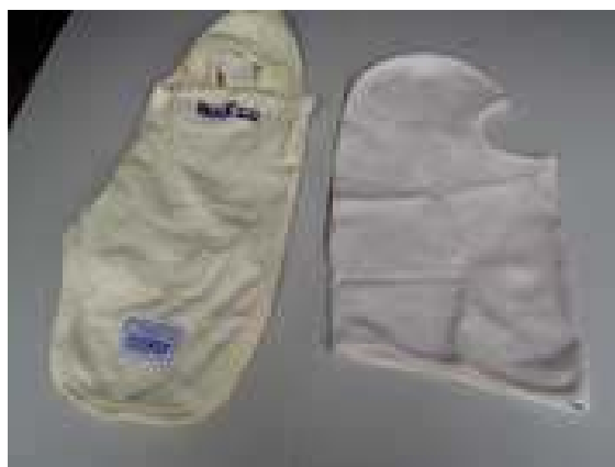
Picture 6: Several types of cowls against heat which are very good to use when the weather is really chilling.

Besides flame resistance is a very important aspect that it can not cause irritation. Suggested period of time to wear: 5 years