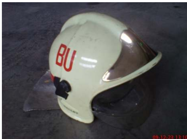
Picture 5: Draeger Gallet sortie helmet for firemen. (Own picture, 2009.)

manufacturers. They basically differ in the design and cippable devices, equipments. Suggested period of time to wear: 5-15 years