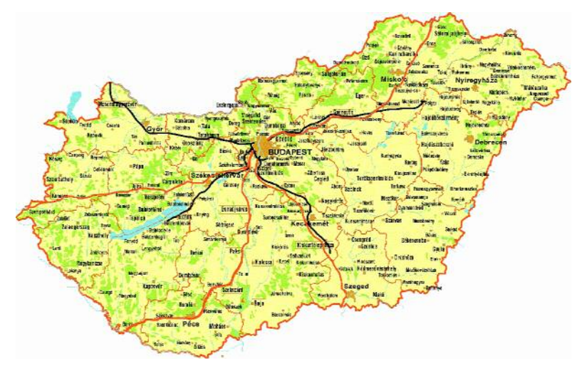
Figure 2. Main roads in Hungary exposed to the highest risk

Roads exposed to the highest risk are motorways M0, M1, M3, M5 and main roads 3, 5, 6, 8 (see Figure 2).