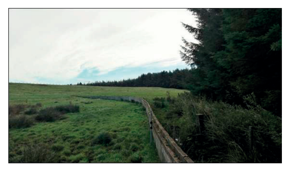
Figure 5. Offline wood barrier at a hilly pasture of Belford

The combined value of storage capacity is ca. 10,000 m<sup>3</sup>, that has an important delaying effect and results a 30% flood peak reduction [24]. The EA is responsible for maintaining the structures. The design life of RAFs is variable, and even depends on flood frequency. For example, in case of the offline wood barrier (Figure 5) it is about 15 years and we have to calculate with the sedimentation in case of barriers, ponds. The RAFs were implemented in close cooperation with the affected farmers. RAFs were built without land purchase but the farmers got compensations. The project was funded by EA (actual cost of project: approx. £200,000) [26].