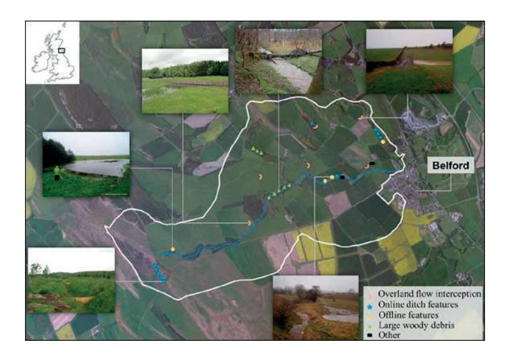
Figure 4. Natural flood prevention measures in Belford [24]

The river basin area of Belford Burn (just outside Belford) is approximately 6 km<sup>2</sup>. In 2007, the flash flood occurred in Belford (~1,200 residents) became widely known in the UK, when the local press interviewed the mayor of the village, and released with the headline "Sick of sandbags and sympathy" [25]. Prior to this event, Belford had been hit by five flash floods occurring over two years, threatening about 30 properties. According to governmental estimations, the building of conventional flood defence would have been £2.5 million. Due to lack of space and cost–benefit anomalies, there was a need to find an alternative solution [24]. The University of Newcastle in partnership with Environmental Agency (EA) launched the Belford Catchment Solutions Project (www.theflowpartnership.org/belford). The main principle of the project was: intercept, store, slow, filter [26]. The design of the implemented measures was based on a catchment area surface model. The model was built on light detection and ranging (LIDAR) measurements. In the project, 35 runoff attenuation features (RAFs) were implemented [24]. Figure 5 shows one of the RAFs.